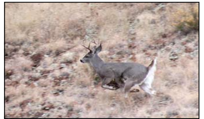
Coues deer photos: Jon Armijo