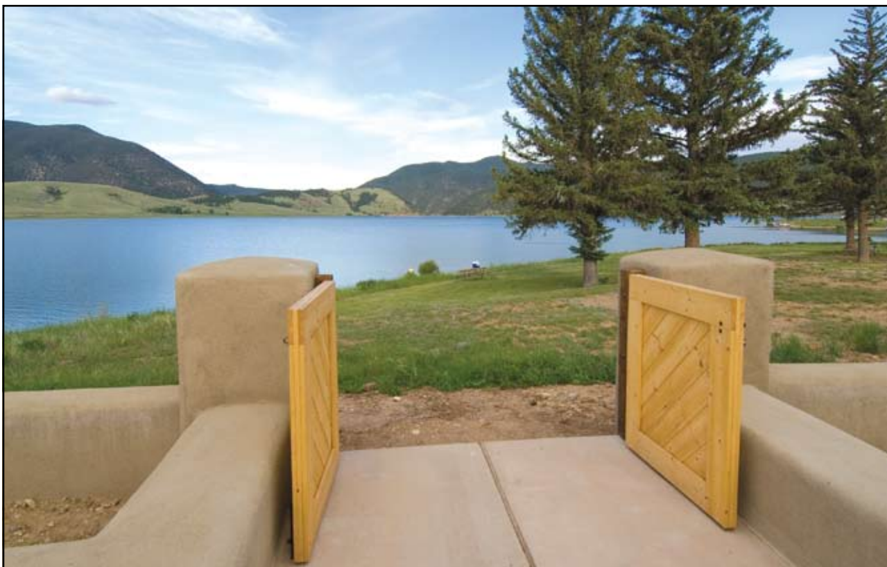
State Parks Architect Rob Vadurro designed the Eagle Nest Lake State Park visitor center complex to be energy efficient while engaging with the Moreno Valley's spectacular landscape.

The grounds around the visitor center and parking area will be landscaped with native plants and irrigated using an automatic drip system supplemented by stormwater infiltration. Plants include aspen, cottonwood, red osier dogwood,