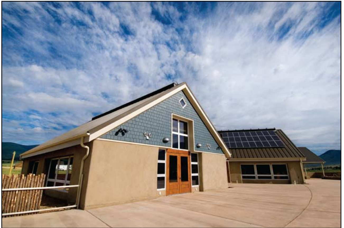
Eagle Nest Lake State Park's new 3,770 square-foot visitor center and surrounding pavilion will be an ideal spot to view the community's annual July 4 fireworks show on the lake.

In this case, the building is insulated with straw -- leftover stems from cereal farming -- a waste product that is dried and compressed for straw-bale construction. Topped with a 12-inch thick SIP (Structural Insulating Panel) roof system and inset with triple-glazed windows that are attuned to direction, it takes full advantage of the sun's warmth in winter. To that mix was added photovoltaic panels and a vertical wind turbine that resembles a giant inverted egg-beater. Linked to the Kit Carson Electric Cooperative, the two “green” energy systems funnel excess power back to the cooperative. During times of severe