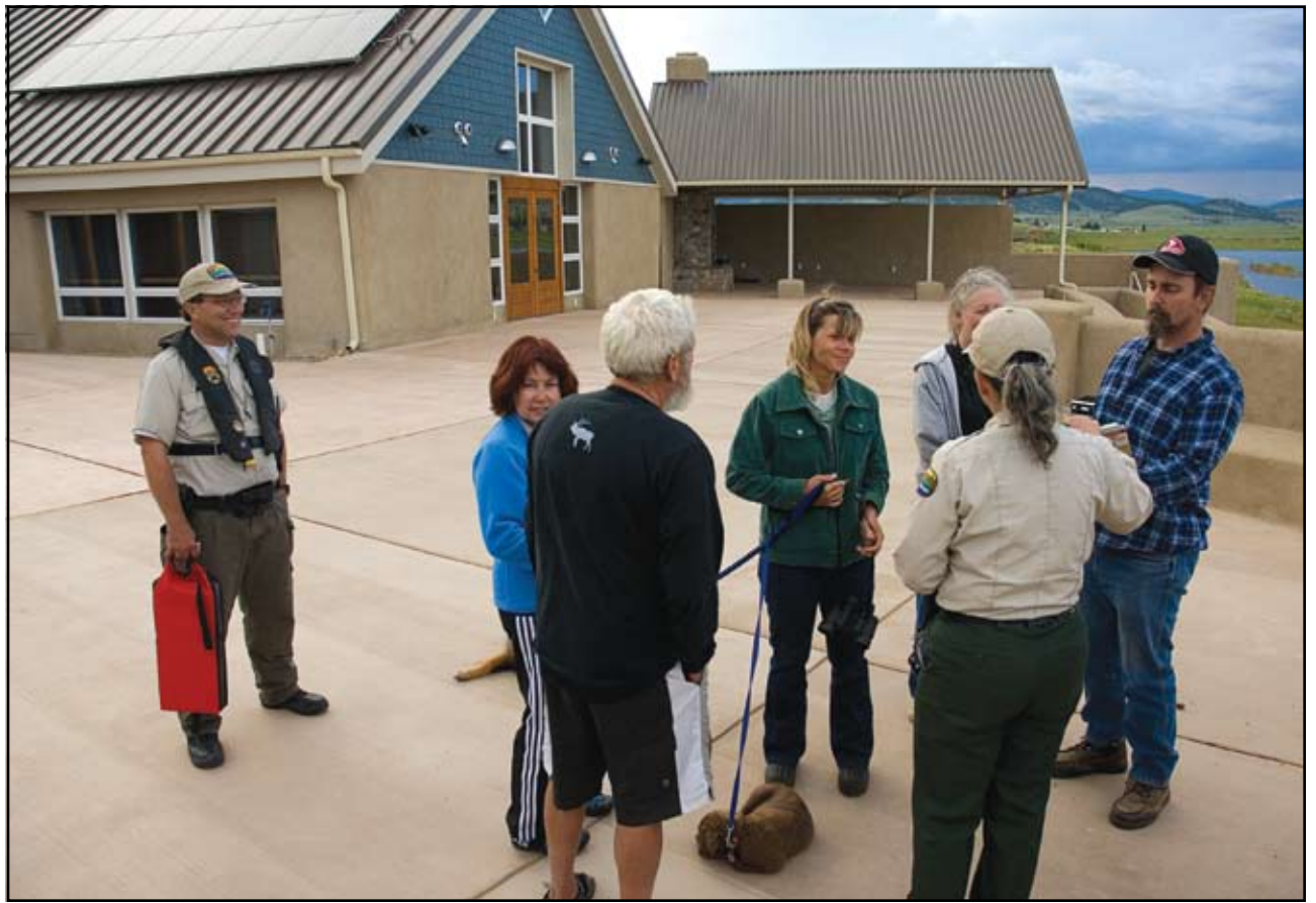
Interpretive programs will be among activities offered at the the new visitor center complex at Eagle Nest Lake State Park, which gets most of its power from solar panels and a vertical wind turbine, below.

For more information about the park, please call (575) 377-1594.